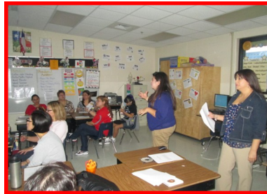
Lopez Teacher Specialists presenting on Literacy Centers