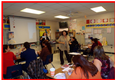
Porter Specialist discussing Elementary Writing strategies