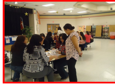
Rivera Specialists engaging the audience in Literature Circles