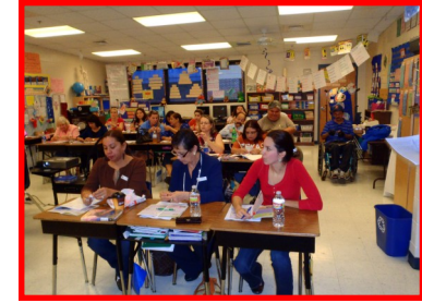
Veterans Teacher Specialists presenting Go Figure 19!