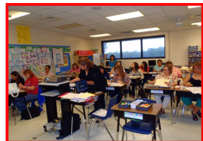
Response to Intervention presentation by Pace Specialists